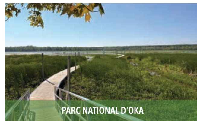
PARC NATIONAL D'OKA

1600, chemin d'Oka, Oka, J0N 1E0 450 415-0651 | abbayeoka.ca