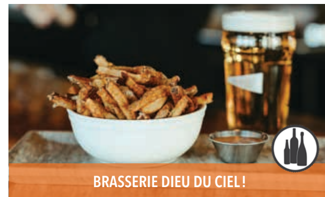
BRASSERIE DIEU DU CIEL!

12655, Services A-4, Mirabel, J7N 1G7 450 476-1000 | helibellule.ca