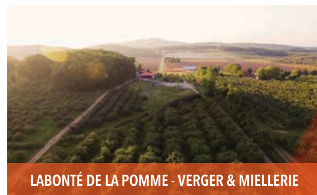
LABONTÉ DE LA POMME - VERGER & MIELLERIE

190, rue des Angles - Quai municipal, Oka, J0N 1E0 438 444-4419 | traverseoka.ca