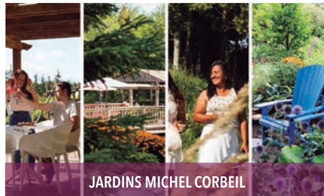
JARDINS MICHEL CORBEIL

4 The Constantin family has brought another project to life: The Route 8 microbrewery offers eight artisanal beers brewed on-site. Whether you're an ale, IPA, red, white, or dark beer kind of person, the master brewer's creations are sure to offer your taste buds something new. As part of its ongoing commitment to offering quality products that elevate local resources, Route 8 has created classic, authentic beers with Québec flavours using products from the local food industry. The beers are available for sale at the Produits d'Antan store at Constantin sugar shack, daily from 9 a.m. to 5 p.m. 1054, boul. Arthur-Sauvé, Saint-Eustache, J7R 4K3 450 473-2374, 1 800 363-2464 route8.ca | produitsdantan.com