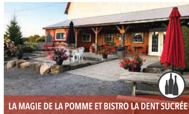
LA MAGIE DE LA POMME ET BISTRO LA DENT SUCRÉE

961, boul. Arthur-Sauvé, Saint-Eustache, J7R 4K3 450 472-4358 | jardinsmichelcorbeil.com