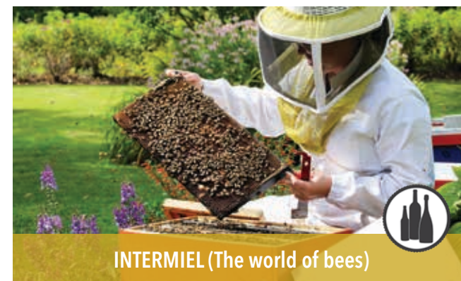
INTER MIEL (The world of bees)

8871, rang Saint-Vincent, Mirabel, J7N 2W5 450 258-3412 | boucannerie.com