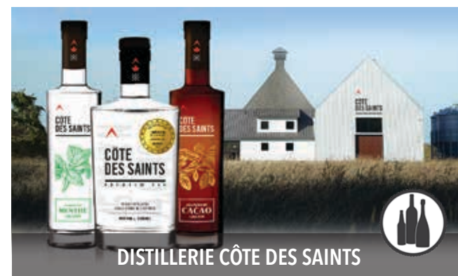
DISTILLERIE CÔTE DES SAINTS

432, rue Lafleur, Lachute, J8H 1R4 450 822-7436 | lesthesargenteuil.ca