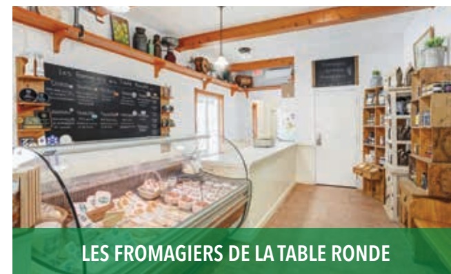
LES FROMAGIERS DE LA TABLE RONDE

248, rue Godmer, Saint-Jérôme, J7Z 5H5 450 436-3438 | dieuduciel.com