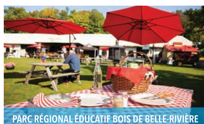
PARC RÉGIONAL ÉDUCATIF BOIS DE BELLE-RIVIÈRE

925, chemin Fresnière, Saint-Eustache, J7R 0G3 450 623-0062 | lamagiedelapomme.com