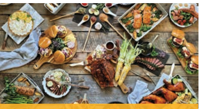
CABANE À SUCRE CONSTANTIN & LOCAL PRODUCTS SHOP

807, chemin de la Rivière Nord, Saint-Eustache, J7R 0J5 450 491-3997 | vignobleriviereduchene.ca