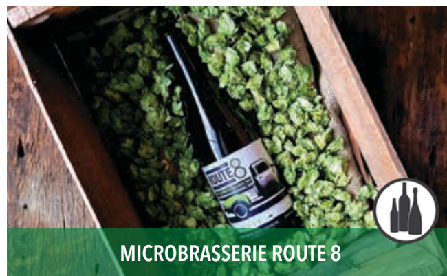
MICROBRASSERIE ROUTE 8

1054, boul. Arthur-Sauvé, Saint-Eustache, J7R 4K3 450 473-2374, 1 800 363-2464 constantin.ca | produitsdantan.com