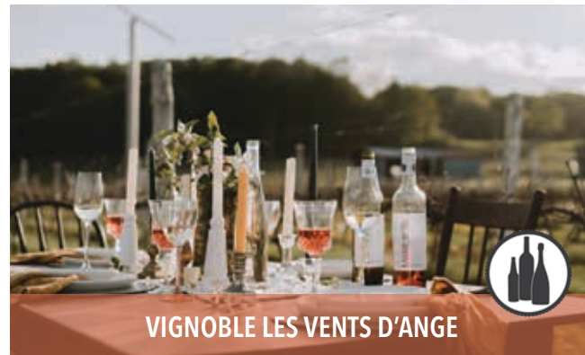
VIGNOBLE LES VENTS D'ANGE

854, chemin Principal, Saint-Joseph-du-Lac, J0N 1M0 450 623-4889