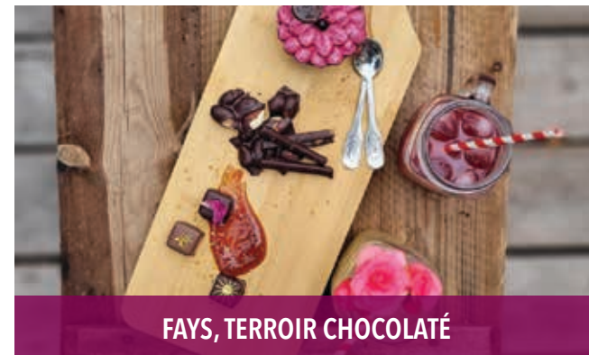
FAYS, TERROIR CHOCOLATÉ

2020, chemin d'Oka, Oka, J0N 1E0 450 479-8365 | sepaq.com/pq/oka