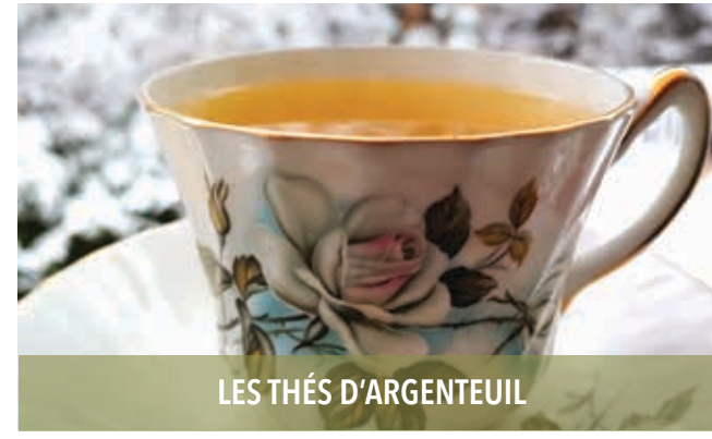
LES THÉS D'ARGENTEUIL

405, rang de l'Annonciation, Oka, J0N 1E0 450 479-1111 | labontedelapomme.ca