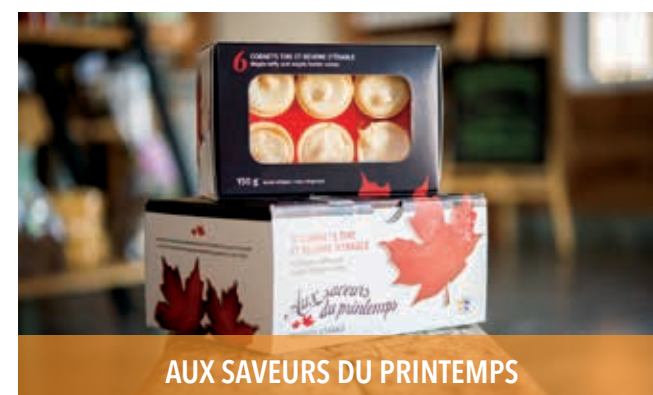
AUX SAVEURS DU PRINTEMPS

12465, côte des Saints, Mirabel, J7N 2W1 1 888 880-0401 | cotedessaints.com