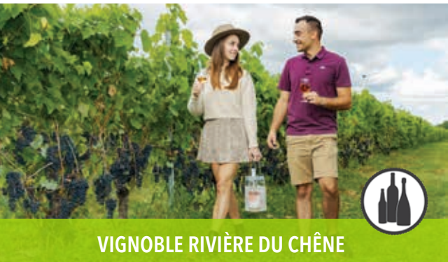
VIGNOBLE RIVIÈRE DU CHÊNE

232, rue Saint-Eustache, Saint-Eustache, J7R 2L7 450 974-5170 | vieuxsainteustache.com