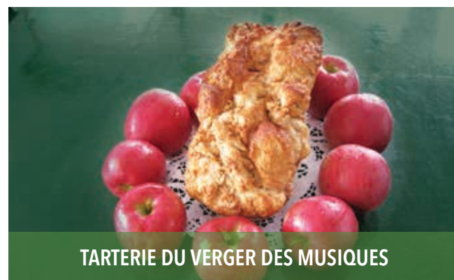
TARTERIE DU VERGER DES MUSIQUES

1473, chemin Principal, Saint-Joseph-du-Lac, J0N 1M0 450 491-7859 | domainelafrance.com